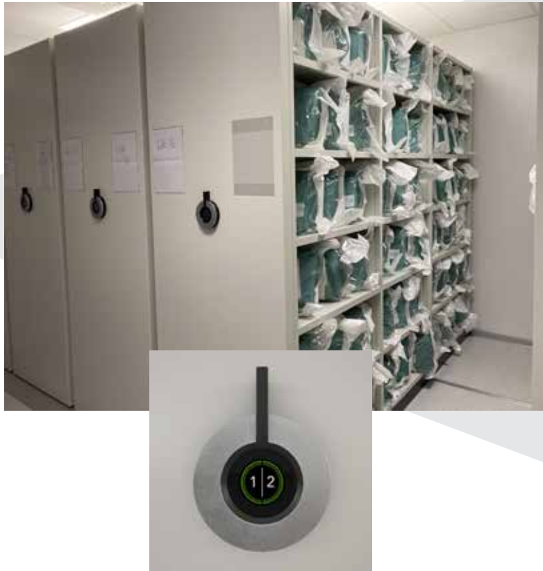
Electronically driven system

The mobile shelves are delivered with either a manually operated system or with our electronic user interface. It is possible to convert from a manual system to an electronically driven system.