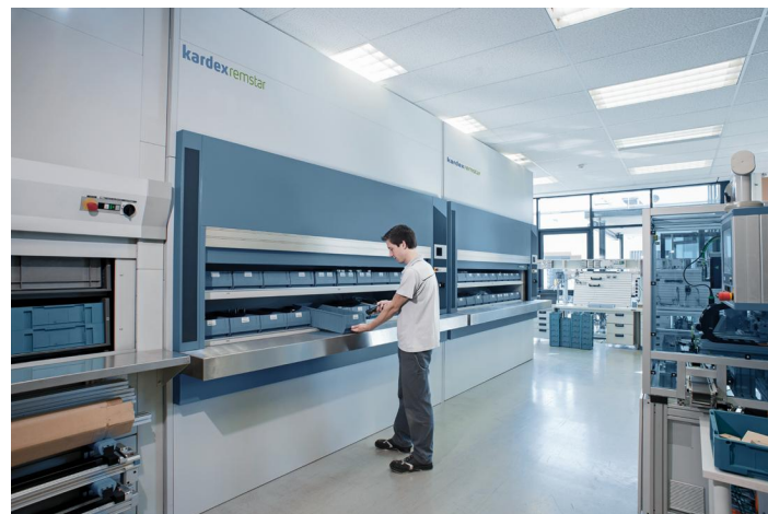
Spare parts management with Kardex Megamats

Further options and storage environments with air conditioning, clean room, fire protection or esd versions are available.