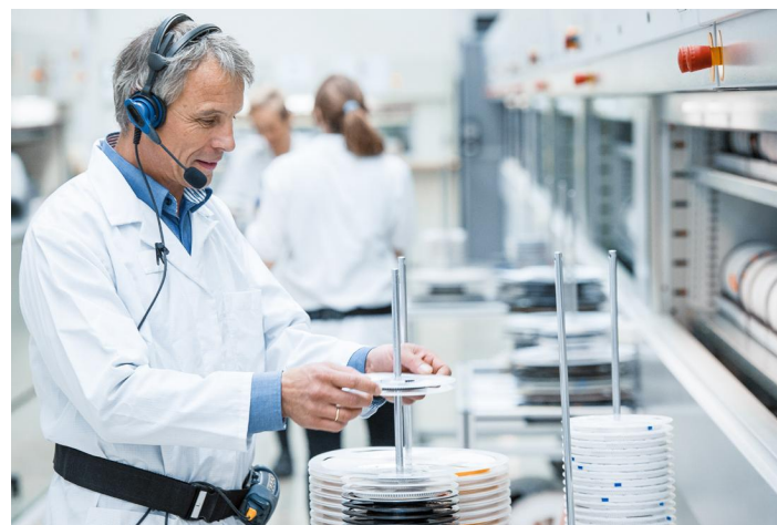
SMD handling with Kardex Megamats